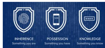
Strong Customer Authentication