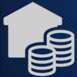
Integrated home solutions